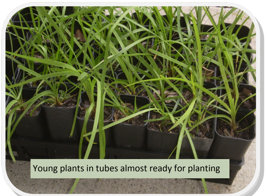
Young plants in tubes almost ready for planting

When using chemicals, always follow instructions on the label and wear correct protective clothing.