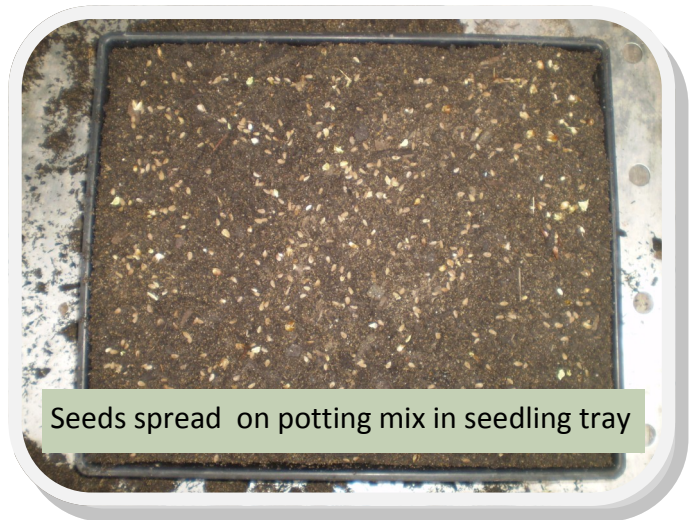
Seeds spread on potting mix in seedling tray