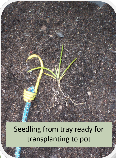
Seedling from tray ready for transplanting to pot