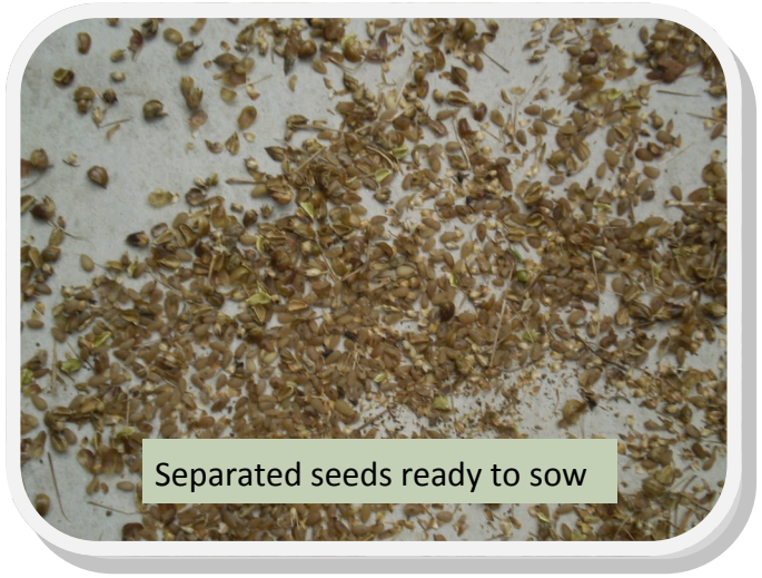
Separated seeds ready to sow

Hand weeding or brush cutting are alternative maintenance techniques.