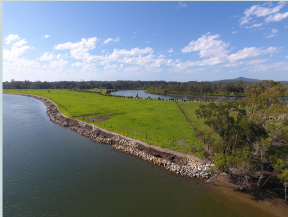
Image: Rock revetment at Newry Island

Application fees will be associated with all permits/licences. You may also be required to have a survey completed to clarify land ownership. Remember to factor these in to your total project cost.