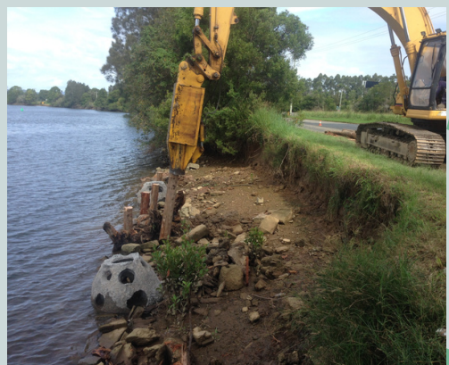
Image: Driving pins for rock fillet works at Mylestom

There are a number of private consultants working in the area also.