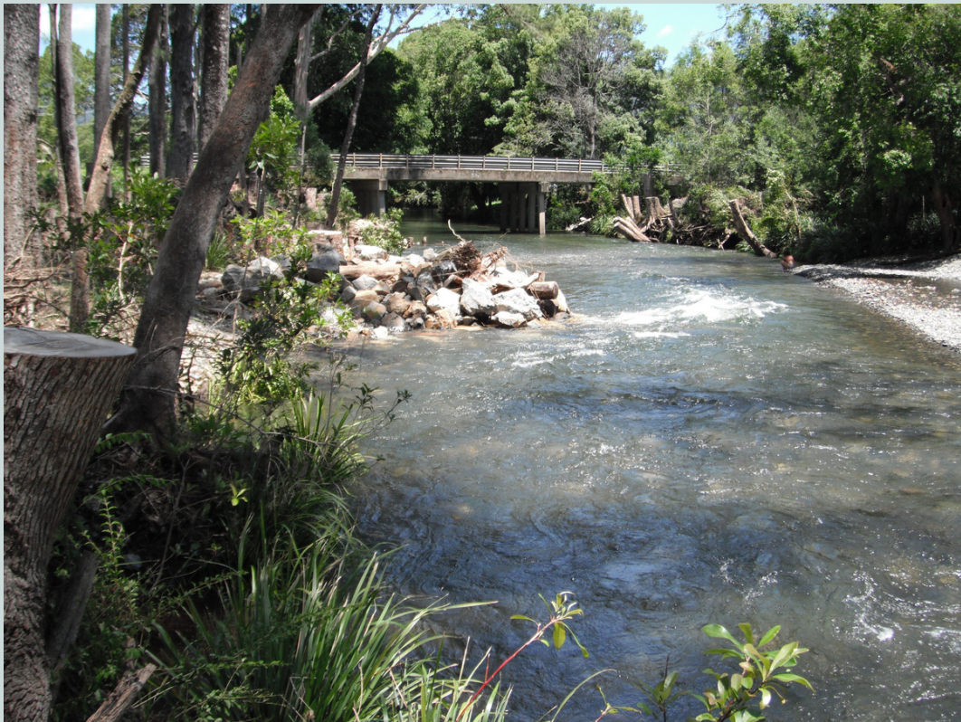
Image: Rock Groynes Never Never River.

Revegetating Streams in the Bellinger and Coffs Harbour Catchments